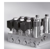
6-fold valve block with integrated system components