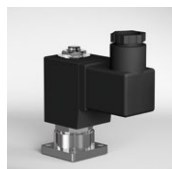
type 52FL direct operating with flange-top