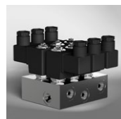
6-fold high pressure valve block – direct operating