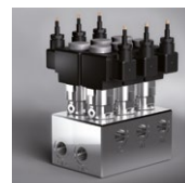
Cartridge pilot operated