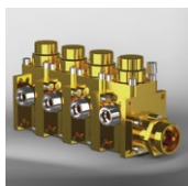
High pressure water dispenser